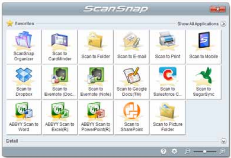
Quick Menu for Windows® shown

The ScanSnap Quick Menu for PC and Mac automatically pops up after scanning to provide you a variety of ways to be immediately productive with your scans. It can be easily customized to display just your favorites, present a recommendation, and even display custom profiles.