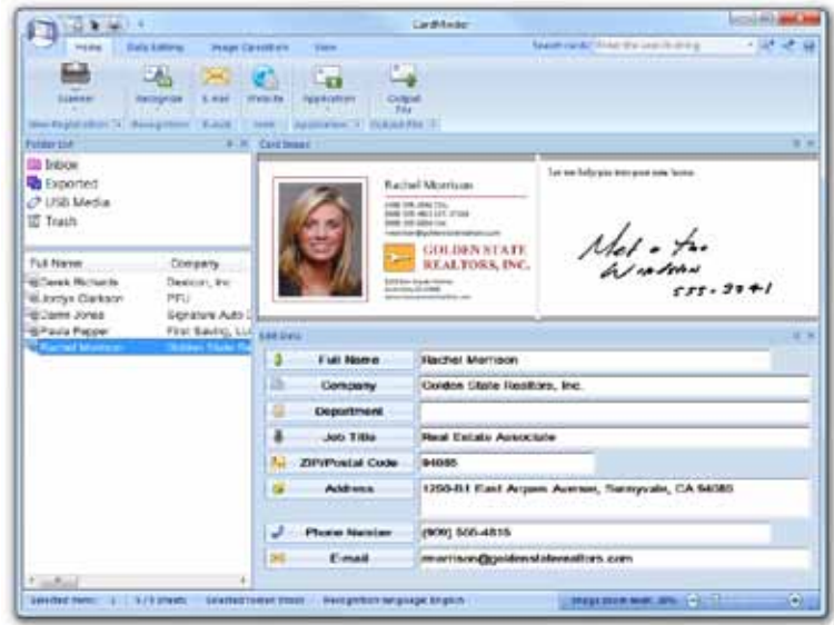
CardMinder for Windows® shown

Scan, store, and edit business card information with the bundled CardMinder software for Mac and PC and even export data into other applications like Address Book, Excel, and Salesforce.